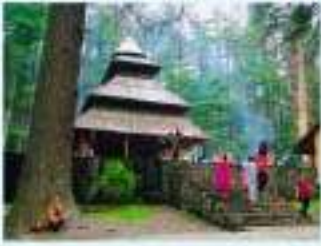
Hidimba Devi Temple

Day 3- Manali sightseeing - Manali is well known for many things. Few of them are Momos, snow, hills & Hidimbadevi temple. We visited famous Vashishtha temple, Hidimbatemple, Ghatotkach temple and mall