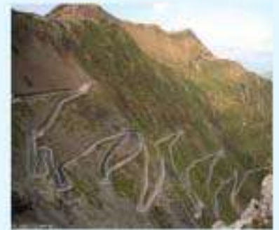
"21 Gata Loops"

The road is said to be haunted by a ghost of traveller who was buried here. Luckily, we were able to cross it safely. After crossing Nakeela pass, we briefly halted for Whisky Nalla enjoying the fresh stream of waters running down the