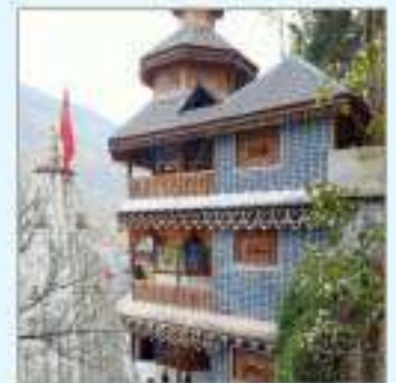
Vaishno Devi Temple

Day 2- Ambala to Manali– Himachal Pradesh, the mountainous heaven will captivate you at the first sight. Without a gist of pollution this magical state is total refreshment for one & all. It can be said the Himachal is one of the most beautiful state in India. Upon reaching Manali we checked -in to hotel, which had “Paradise” in its name. Upon hearing name of hotel, I was sure this trip was going to be a memorable one. That day was to rest and get acclimatized to altitude and weather. Just before checking in, we halted before a temple. Mata Vaishnodevi temple in Kullu was built by Swami Sevak Dasji Maharaj in 1966. This Mahadevi Tirth is situated on banks of river Beas. This shrine here is multistoreyed building having idols of goddess Parvati as “Mahakali” , goddess Lakshmi & goddess Saraswati installed on each level. An artificial cave was formed to install the idol of goddess Vaishnodevi. We can see beautiful wooden carving & architectural style of Manali.