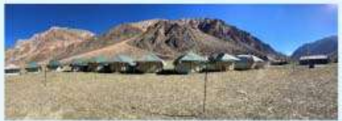
Mulkila Camp Adventure

over stones. No vehicles were able to pass the road block ever truck & trolleys were getting stuck. Again, the uncertainty to continue persisted. We waited for some time but soon I realised the three factors of successful endeavor. As a second-degree reiki holder, I put my effort & time to seek help from ‘Daivam’. I started my reiki with intension that “all & one present here cross the road block within 30 mins. “Grace was shown upon us and suddenly a road construction vehicle came into sight from no-where, the driver said that no one had called him, he had the urge to help all travellers. He was single-handedly levelling the stone to form a path. Thus, we again started our journey to Sarchu with thanking god, the “daivam”. During the travel we passed through “Atal tunnel”, also saw Solang valley, had lunch at authentic HimalayanDhaba. Upon reaching campsite, we checked into “MulkilaCamp Adventure’. Located on national highway 3,