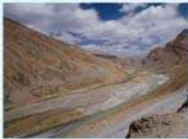
Barrens of Sarchu

Day 4- Manali to Sarchu-I believe my actual trip started from day 4, as we travelled through Himalayas to our next destination ‘Sarchu’. Also known as ‘old silk route’. It also resembles Ladakhwith is barren splendour. From Manali to sarchu we passed through “Bara -lachaLa”, a boundary between two very distinctive forms of nature. Before Bara-Lacha nature was green, having warmth and dynamics just like “Parvati” or “Prakruti”. After Bara-Lacha nature was white with snow clad mountains. It was peace -peace only, as it reminded me of “KarpuraGauram, Karuna Avataram”. Situated above 15000 ft. rivers ‘Chandra’ & ‘Bhaga’