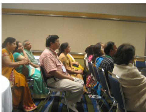
A rapt attentive audience all ears to Guruji's speech