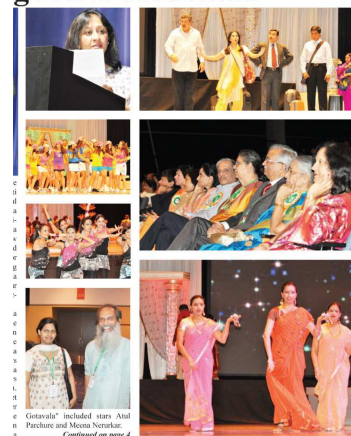
Coverage of the event in Pakistan Times